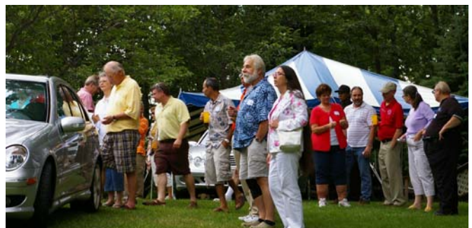
Club members view cars during the ice cream social