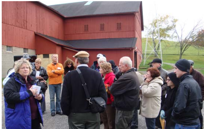
Members gather outside Yoder's Barn

Smiles were seen as the cars started for the less relaxing world, than that of our Amish neighbors.