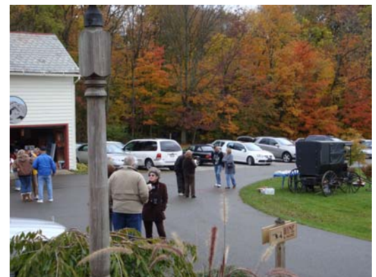
Warming up on coffee and gathering information at Gateway Place