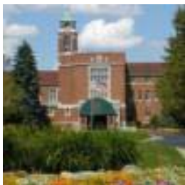
Glenmoor Country Club

The holidays are right around the corner and so is the annual Holiday Party. This year's get-together is on Saturday, January 16 th . We will gather at 6:00 P.M. in the Chapel Party Room at the Glenmoor Country Club. As you may recall, this Country Club