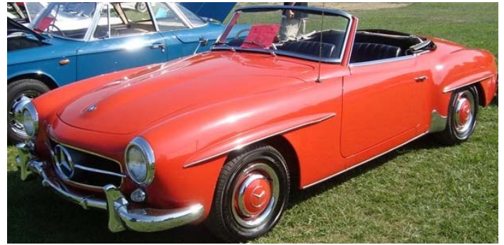
Mark Schmiedl's bright red '63 - 190SL is all shined up and ready to go.